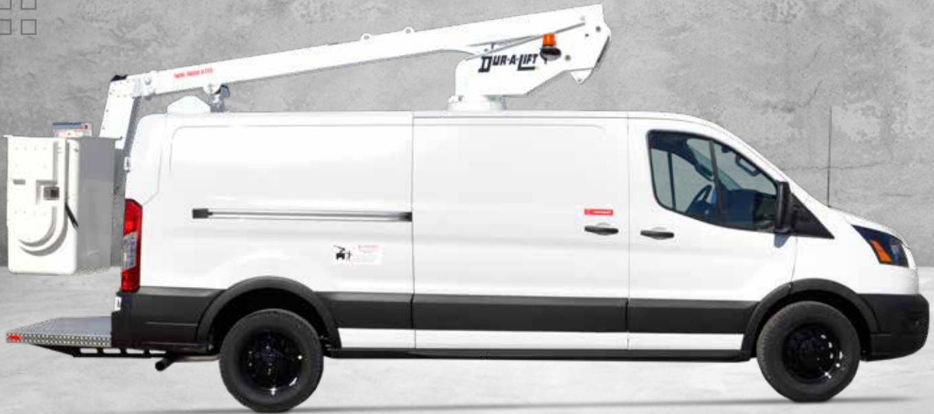
DVT-29 AERIAL LIFT VAN