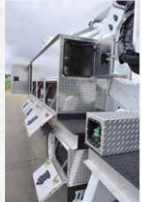
MANY GREAT STORAGE OPTIONS; INCLUDING BULB STORAGE FOR SIGN AND LIGHTING TRUCKS.